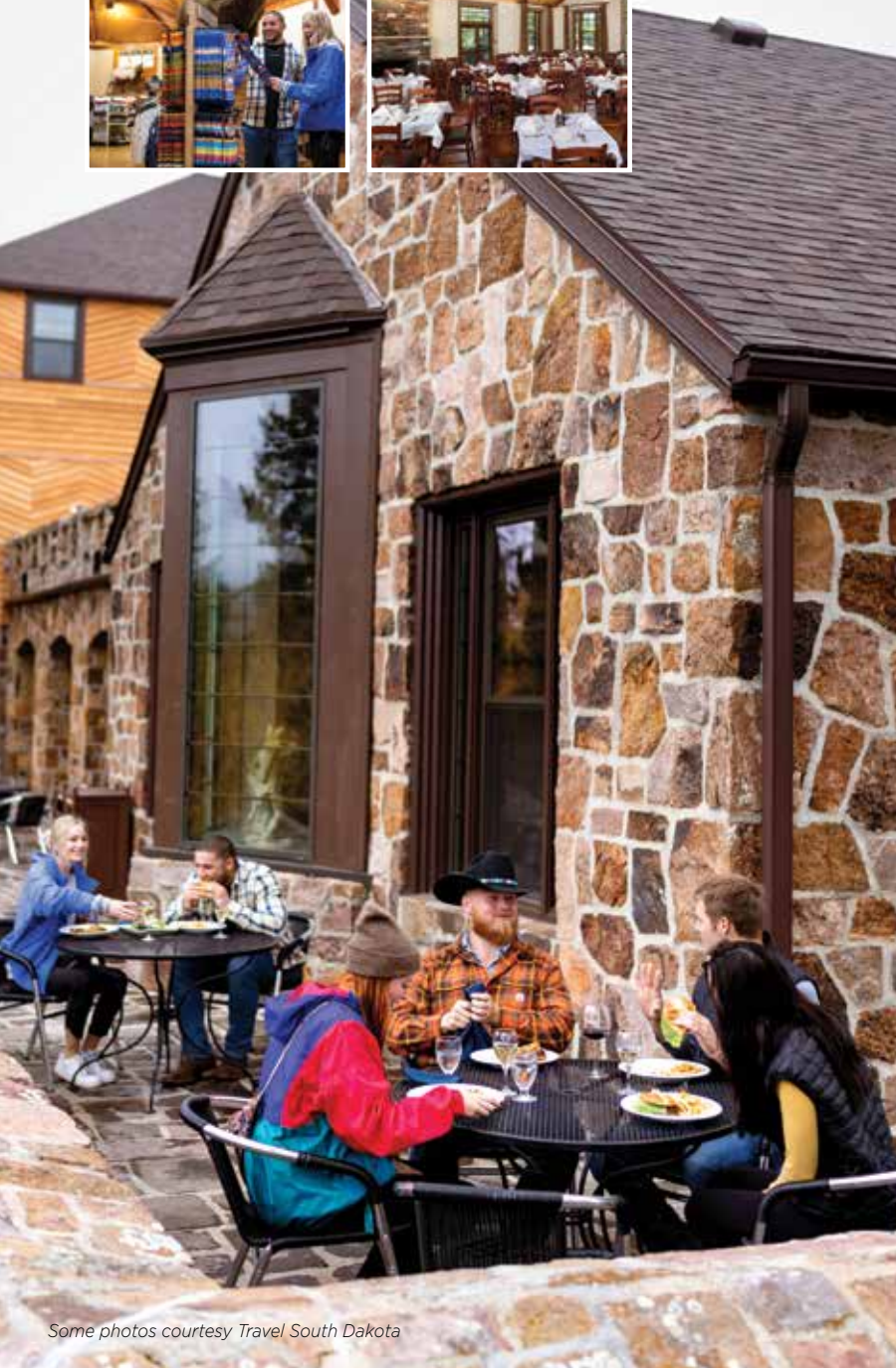
Some photos courtesy Travel South Dakota