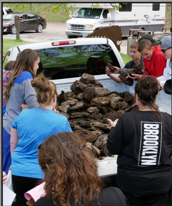
Getting ready for the infamous Buffalo Chip Flip

6:00 p.m. - 7:00 p.m. Movie Night Tatanka Barn in Game Lodge Campground